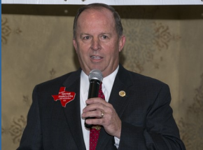
Candidates and Elected officials of Galveston County