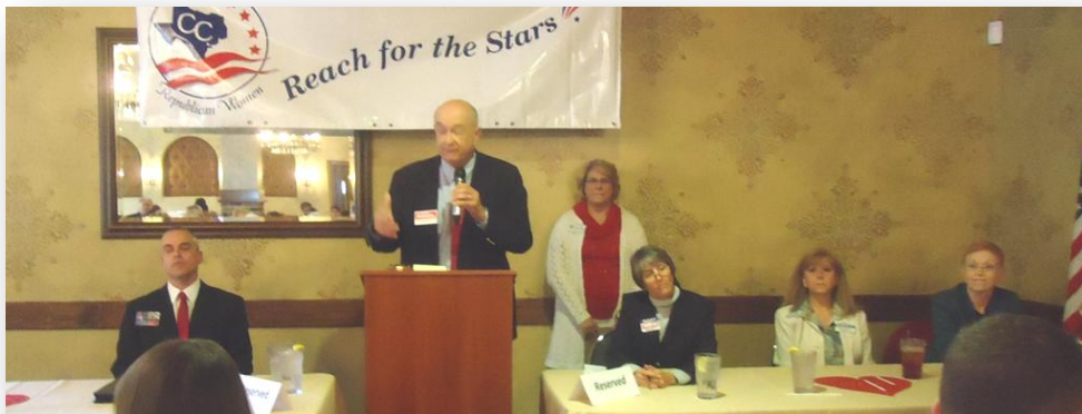
Precinct 1 and Precinct 2 Justice Of The Peace Debate