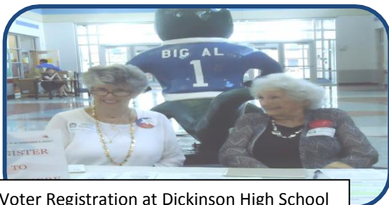
Voter Registration at Dickinson High School