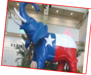
AT THE REPUBLICAN CONVENTION