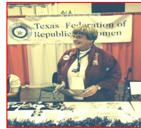
Manning the TFRW Booth At GOP Convention