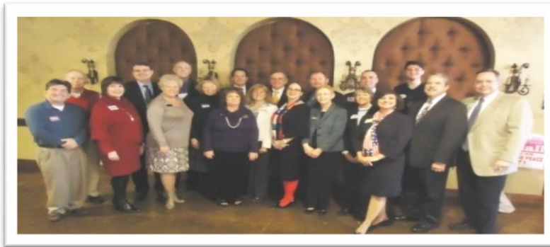
2014 Primary Candidates