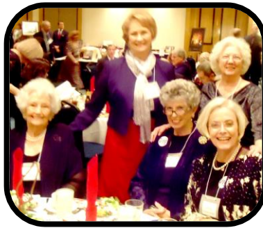
Big Smiles at the LDD