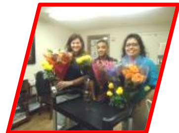
Spring Flowers for Baywind