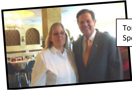
Tom Delay, Former Speaker of the House