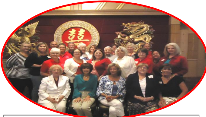
Galveston County RW at GHC Workshop