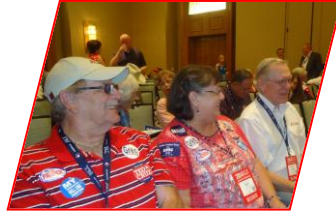
Ready To Get Down To Business