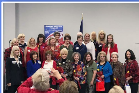
Greater Houston Council Of Federated Republican Women Nut N Bolts Training February 2018