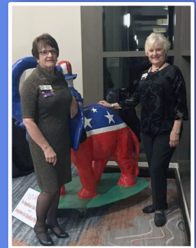
CCRW attends Legislative Day in Austin, Feb 2018