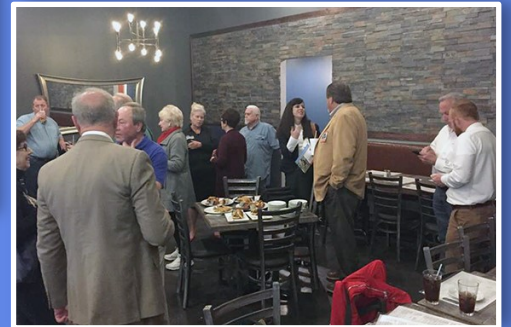
February Mixer at Craft 96 Feb 5, 2018