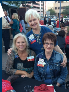
Our Republican ladies touring our state capital, governor's mansion and attending the 2017 TFRW Legislative Day reception & luncheon