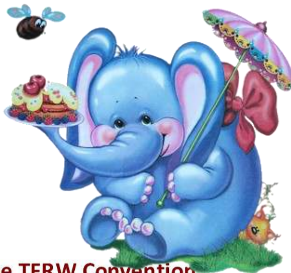
At the TFRW Convention